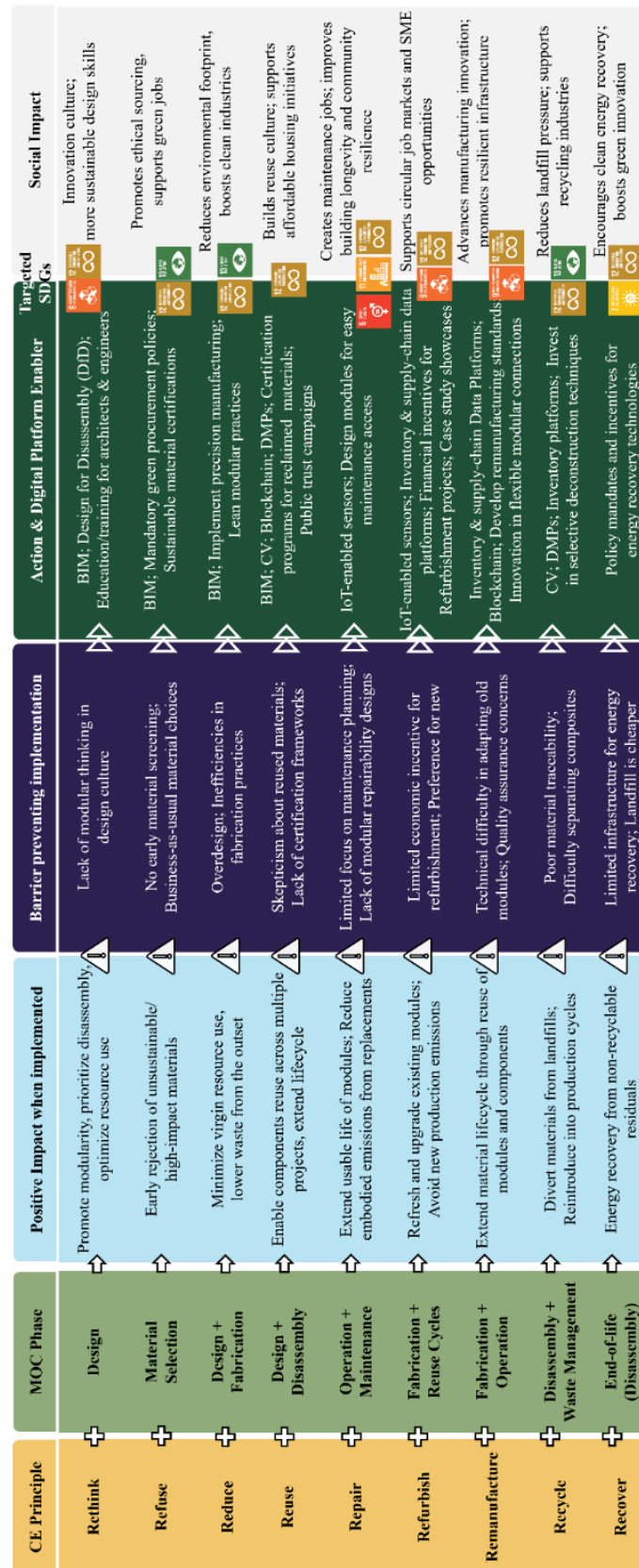
Figure 3. Implementation Framework: How Digital Platforms Enable Circular Economy-Modular Construction Integration. The framework illustrates how specific digital technologies (BIM for lifecycle data integration, blockchain for certification, IoT-sensors for monitoring, CV for quality assurance) operationalize CE principles across each MOC phase (design, manufacturing, assembly, use-phase, recovery), supported by enabling conditions (certification standards, supportive policy, collaborative governance) aligned with UN SDGs.