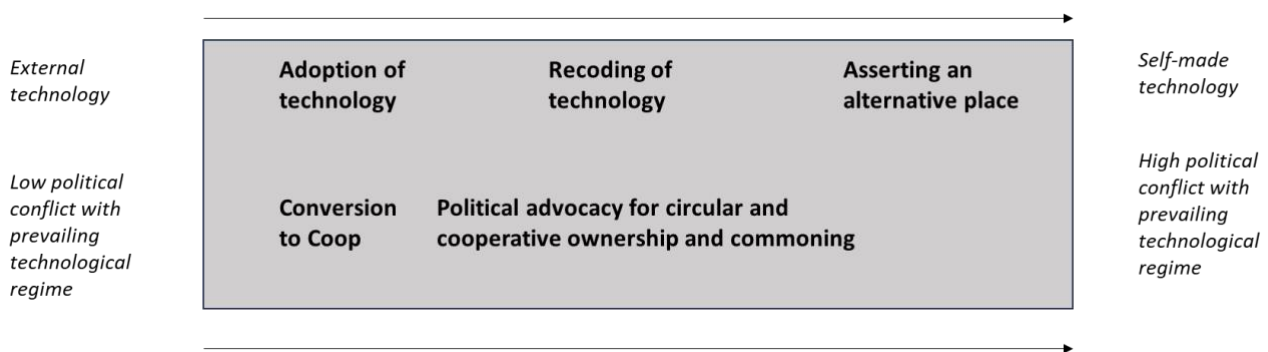
Figure 2. Typology of stances

This section revisits the complementarity between stances along two dimensions and then turns to a critical discussion of the implications for research and practice.